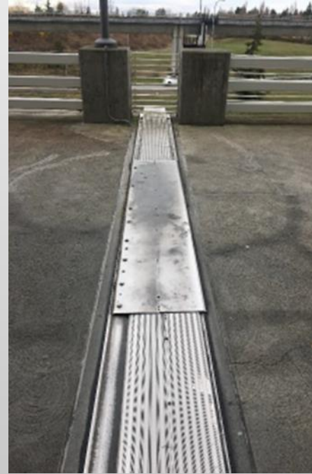
Bus Loop (5 TH Floor) Expansion Joints