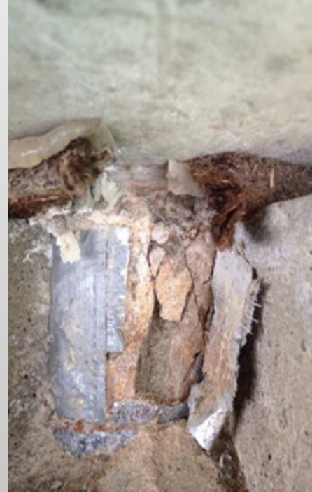
Bridge 2 Spalling