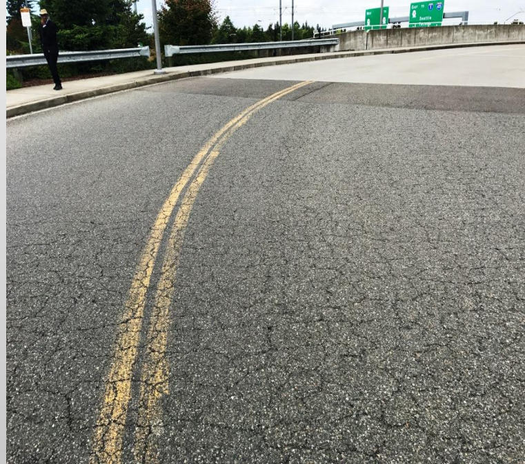
Asphalt Driveway from S. 160 th Street