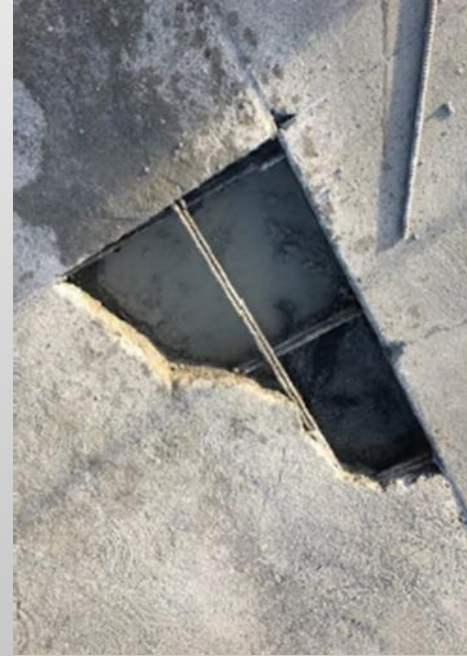
5 th Floor Topping Slab